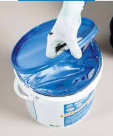
Easy to open lid