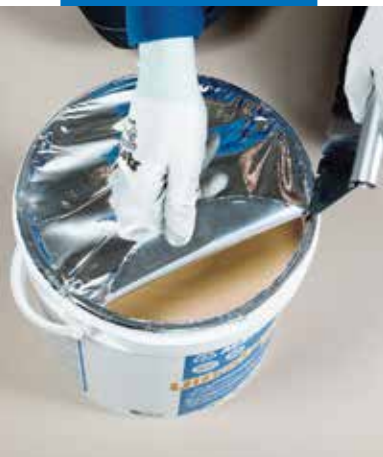
Quick, simple removal of the seal